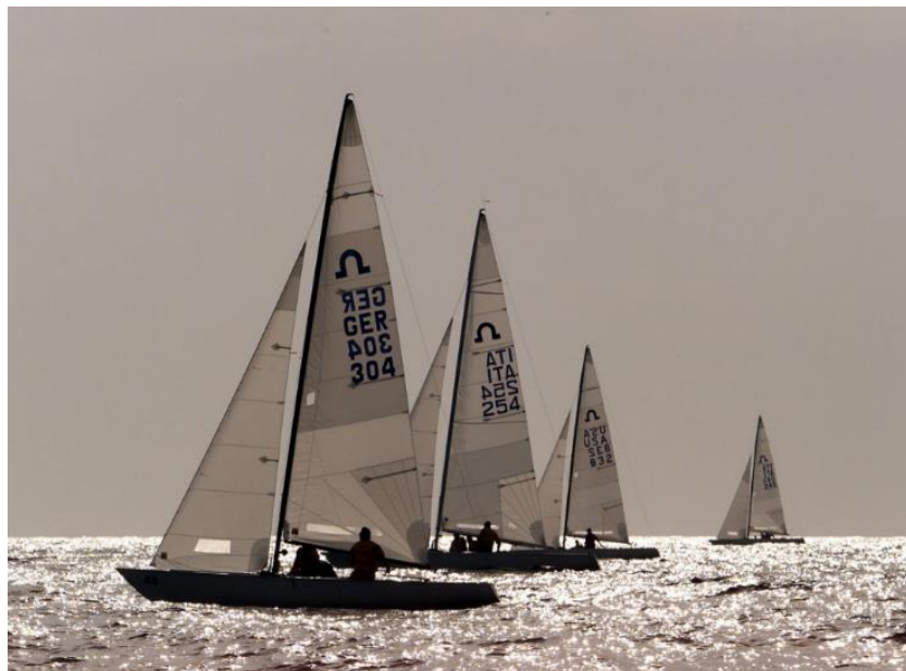
Solings racing in Long Island Sound off Oyster Bay, NY