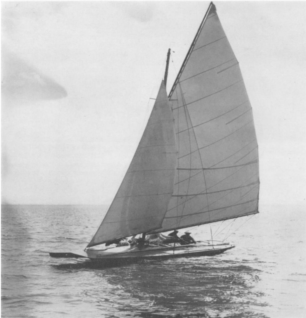
Dominion , Royal St. Lawrence Yacht Club, Winner of Seawanhaka Cup, 1898.

In 1905, the Manchester Yacht Club of Massachusetts challenged the Royal St. Lawrence Yacht Club and won the regatta. The Royal St. Lawrence Yacht Club thereafter challenged the Manchester Yacht Club in 1910 unsuccessfully and the Seawanhaka Cup competition went dormant until the six metre era and the International Rule of yacht design.