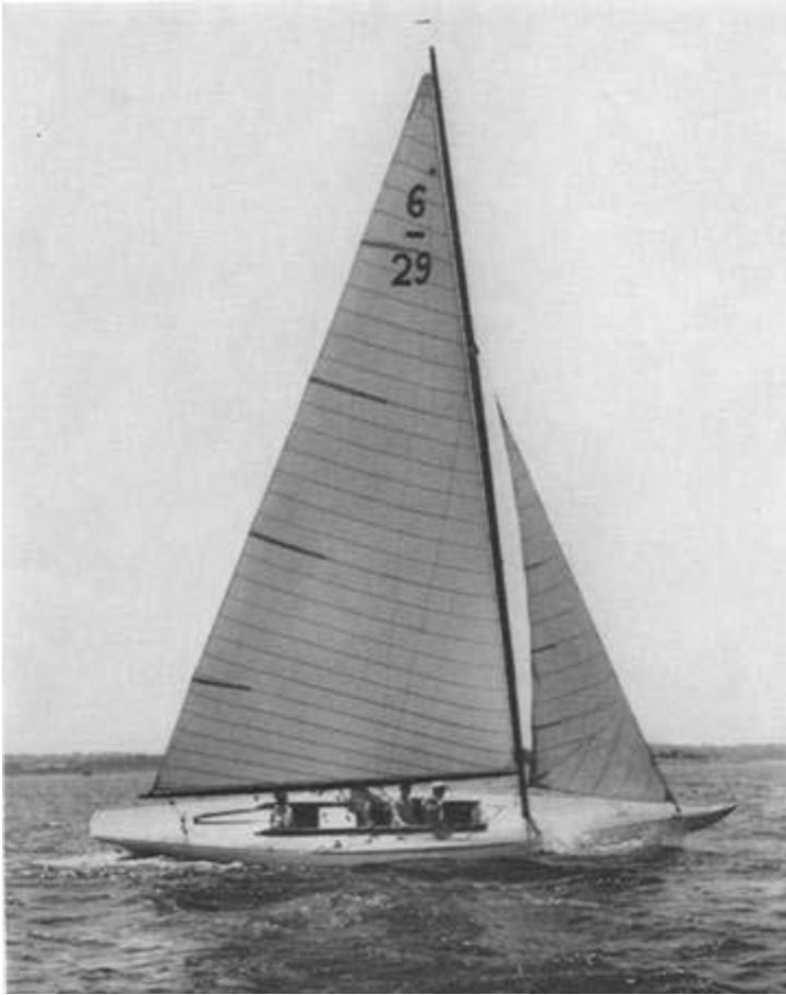
6-Metre Lanai , 1925

In 1932, the competition was back in six metre yachts. Great spectator fleets followed the competition. The Navy usually sent a large vessel to control the crowd. The media followed the competition closely through the late twenties and thirties. In the last competition before World War II, the Royal Northern Yacht Club sailing Circe successfully defended the Cup in a challenge from the Royal Norwegian Yacht Club or Norway sailing Noreg III .