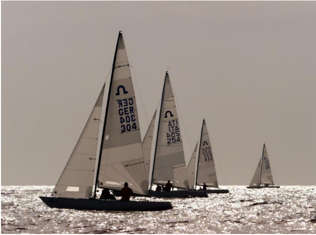
Solings racing in Long Island Sound off Oyster Bay, NY