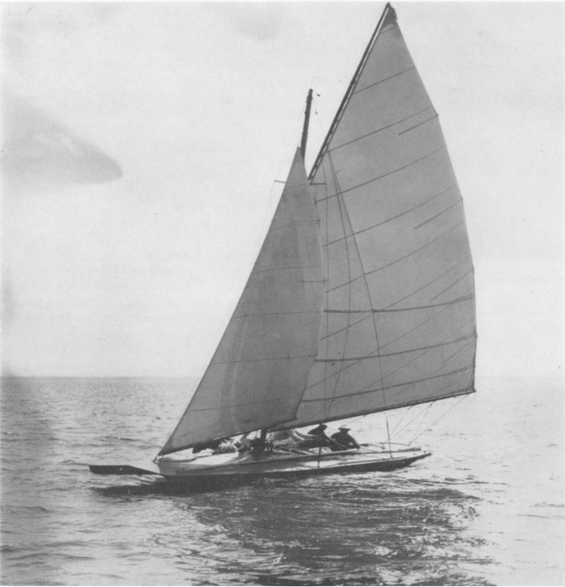
Dominion , Royal St. Lawrence Yacht Club, Winner of Seawanhaka Cup, 1898.

In 1905, the Manchester Yacht Club of Massachusetts challenged the Royal St. Lawrence Yacht Club and won the regatta. The Royal St. Lawrence Yacht Club thereafter challenged the Manchester Yacht Club in 1910 unsuccessfully and the Seawanhaka Cup competition went dormant until the six metre era and the International Rule of yacht design.