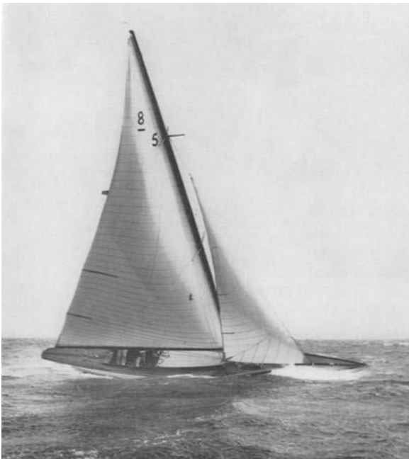
8-Metre Gypsy , 1929

Norway first entered the fray in 1924, and went on to win the Seawanhaka Cup in 1927 with HRH Crown Prince Olav sailing Noreg . The Royal Northern & Clyde Yacht Club remained an active participant in the competition. In 1929 and 1931, eight metre yachts were sailed in the competition.